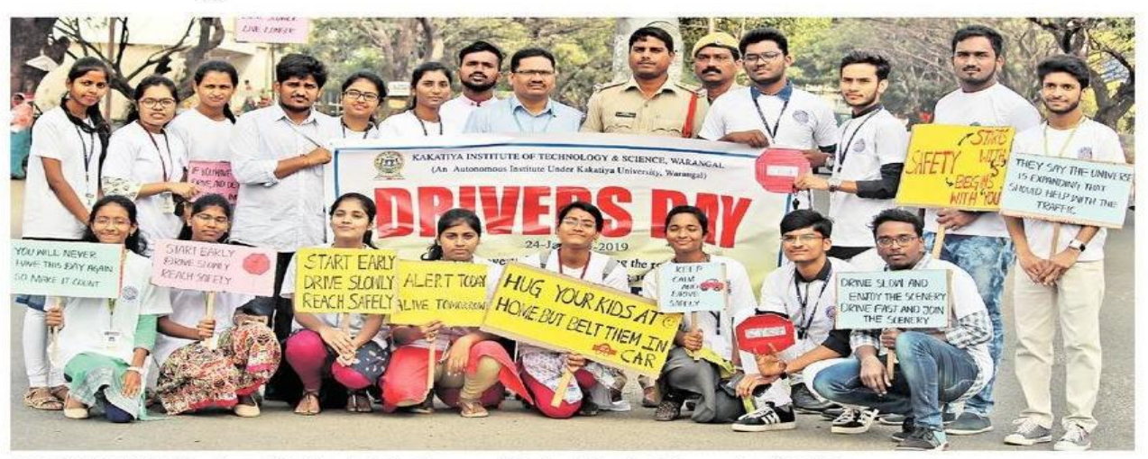
FOR SAFER ROADS: Members of Student Activity Centre and National Service Scheme unit of KITSW at an awareness programme.