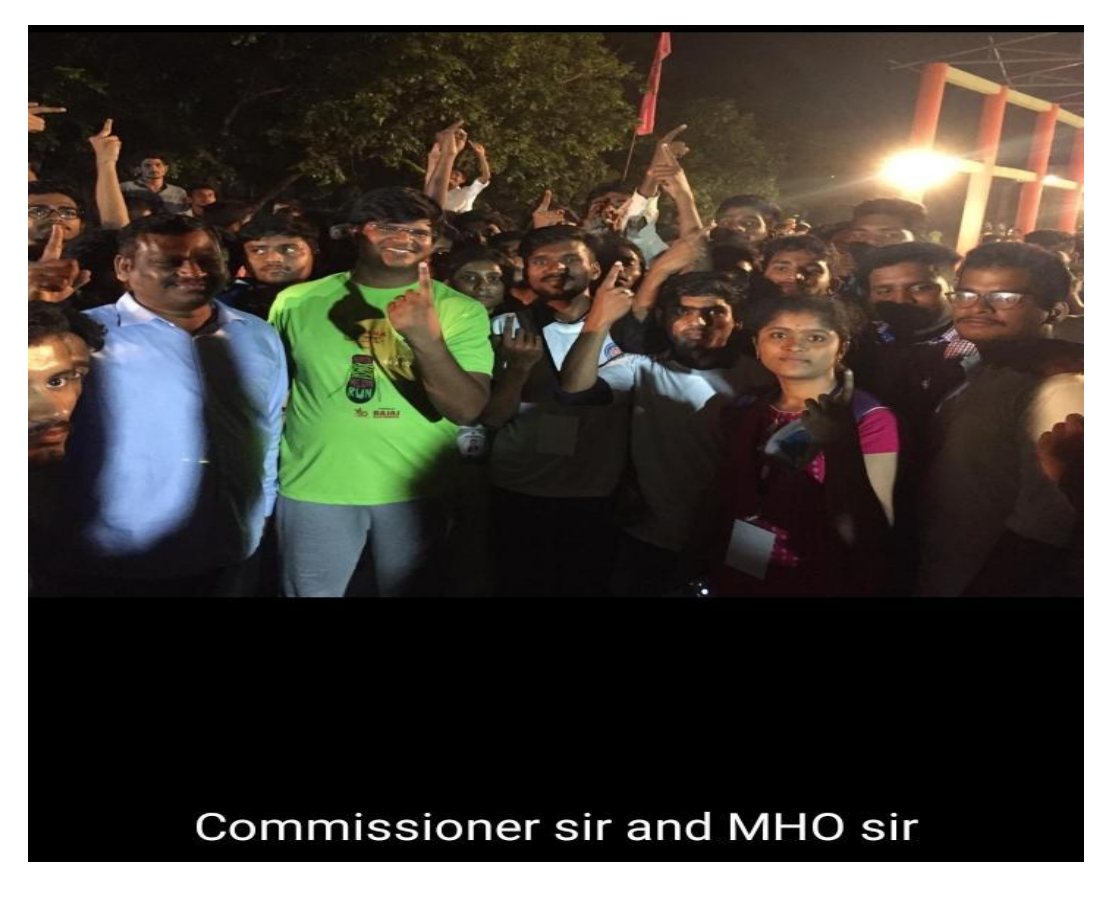
Around 100 Volunteers participated in GWMC 5K run rally on the occasion of "Awareness of Voting right"