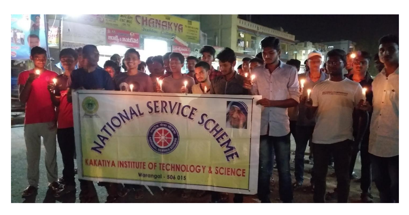
Around 100 volunteers participated in KARGIL DIVAS rally