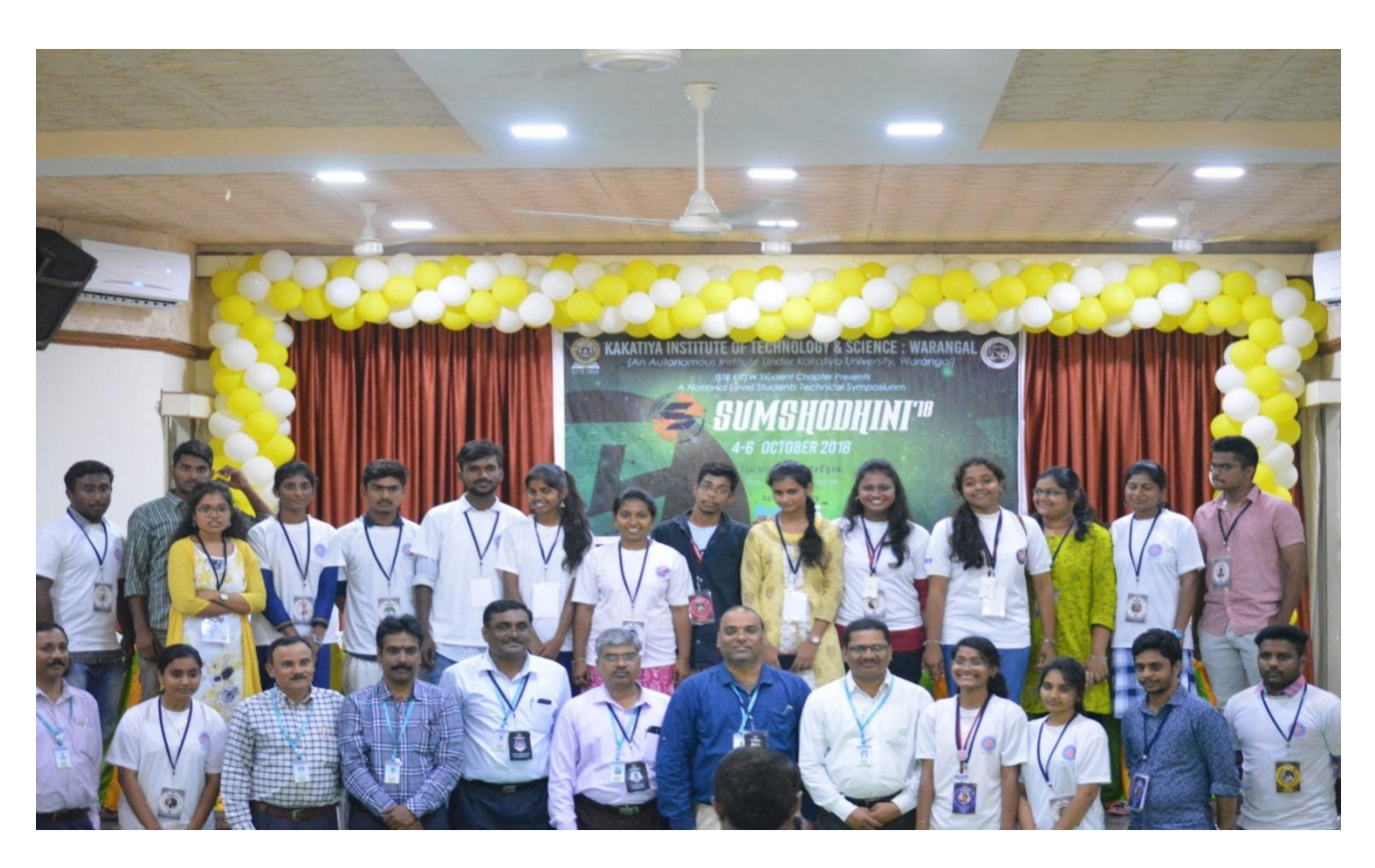
Hosipatality for SUMSHODHINI 18