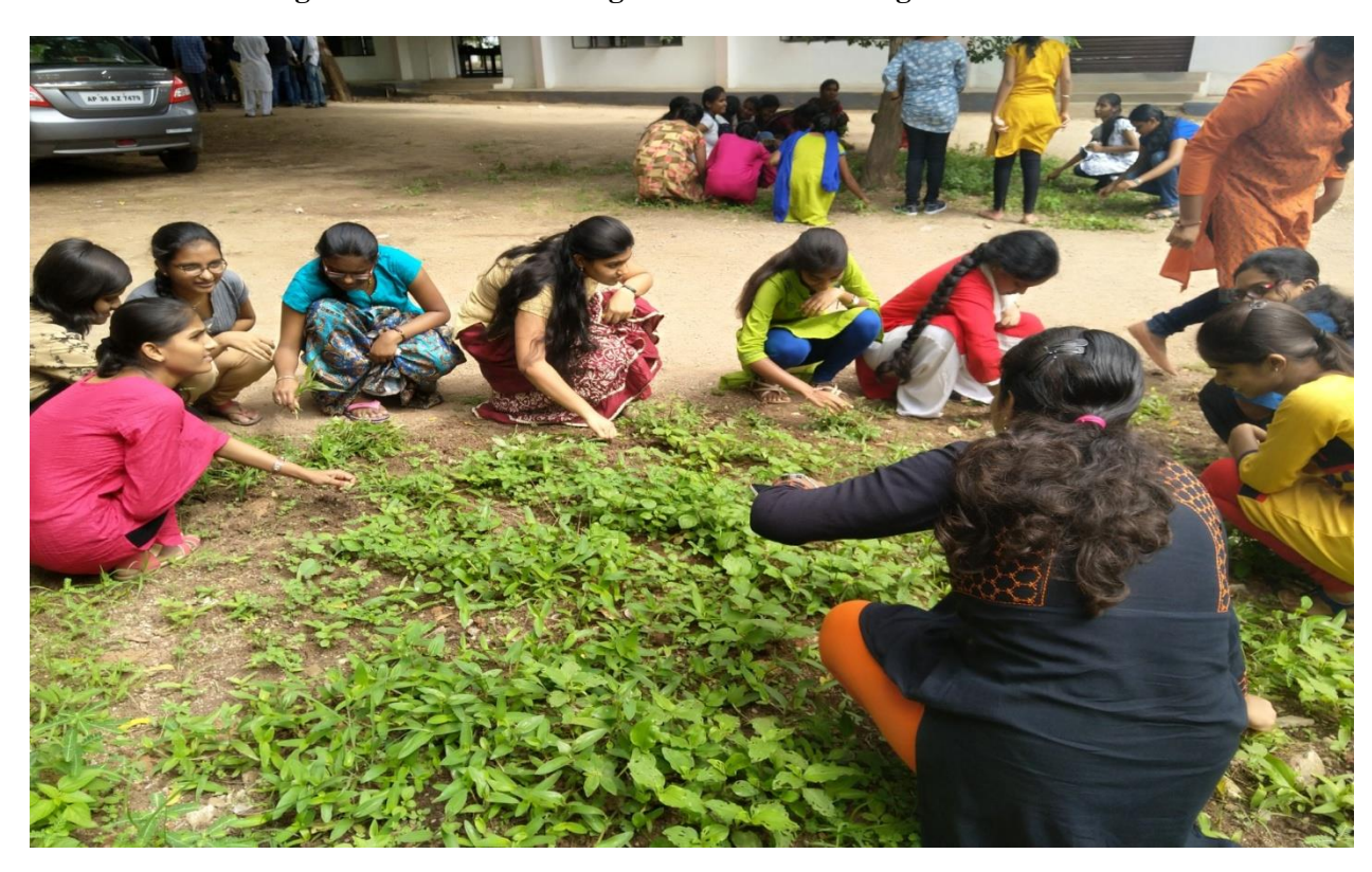
Students Cleaning the Campus during SWACHH KITSW Program