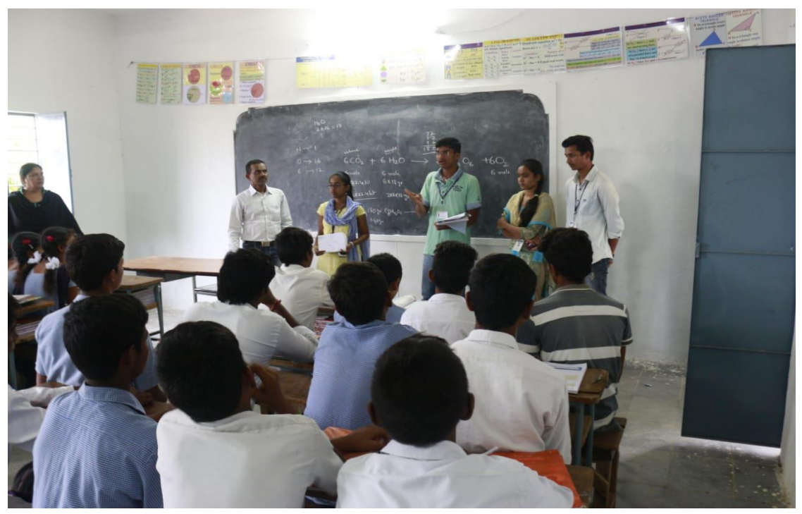
Volunteers Educating Students during the Summer Internship @ Kondaparthy