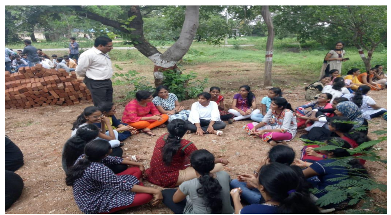
NSS Program Officer Interacting with Students during Swachh KITS Event