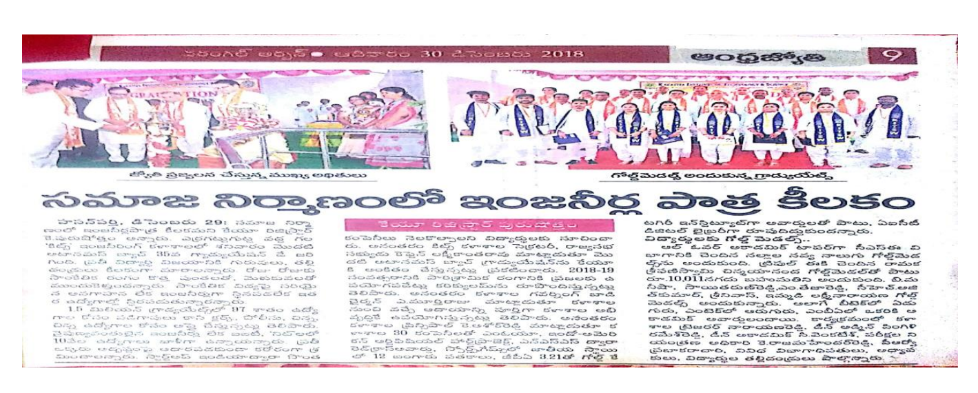
GRADUATION DAY for 2017 Passed out batch