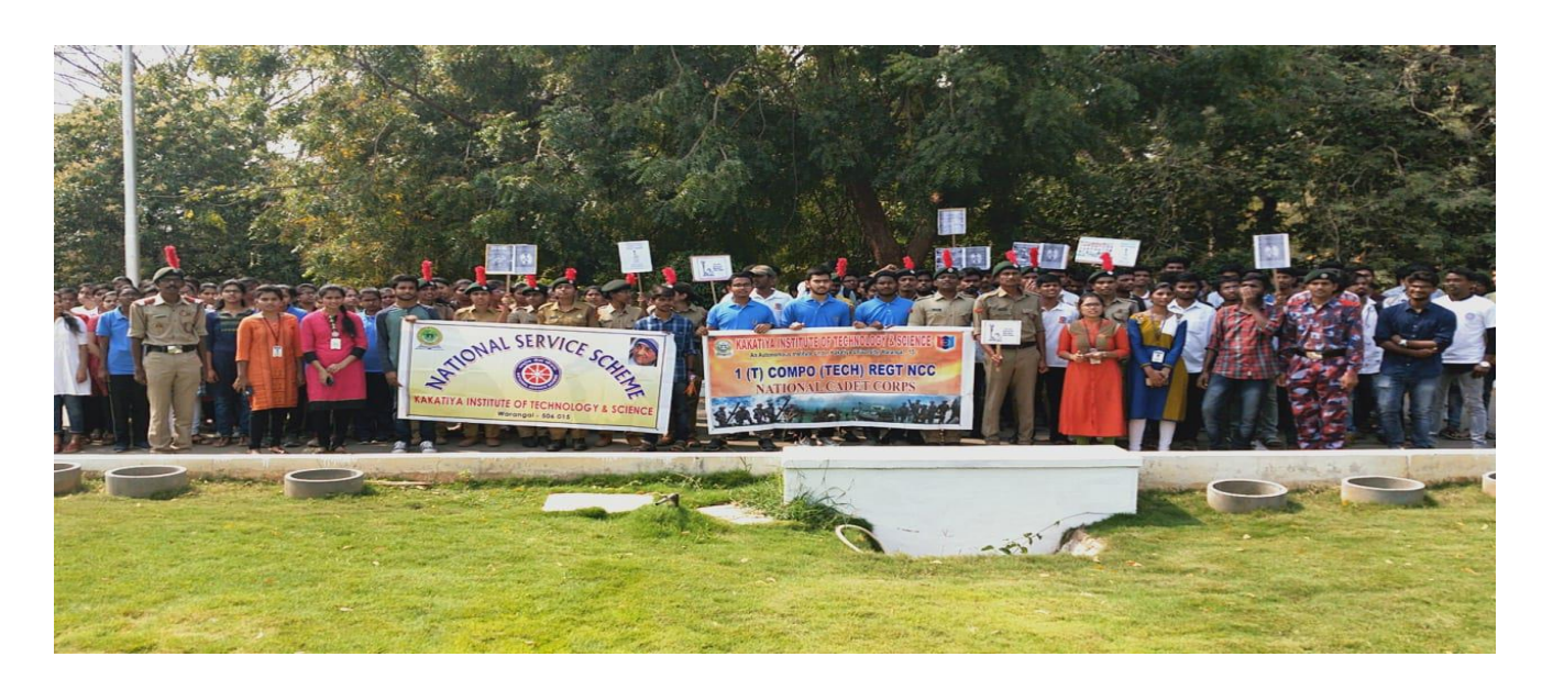
Rally in Memory of the Martyred CRPF Jawans