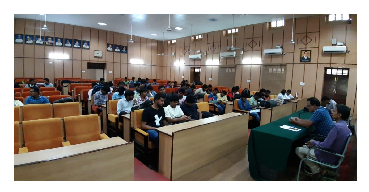
WEB CASTING Duty for State Elections