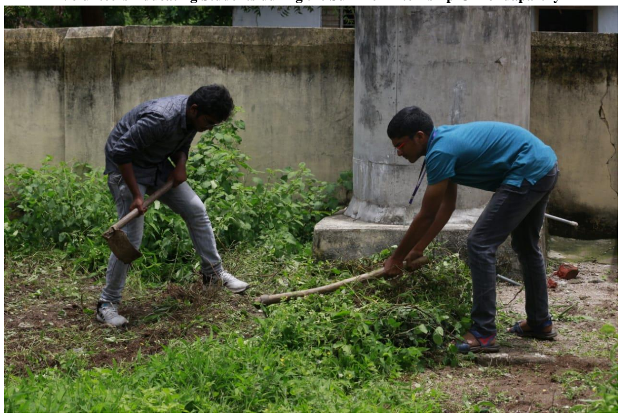
NSS Volunteers cleaning the village during the course of the Internship, @ Kondaparthy (V)